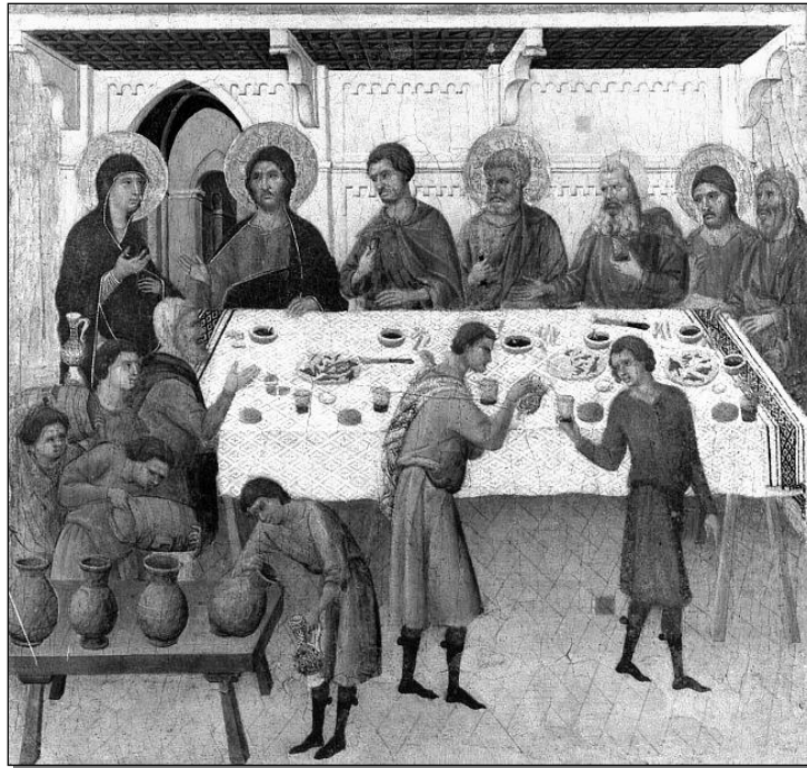
Wedding at Cana. Duccio di Buoninsegna (1308-1311)